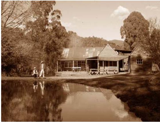
Your Hosts, Graeme and Wendy Stoney.

Swim or fish in the Howqua River, bushwalk, horse ride, 4-wheel drive, visit cattlemen's huts or just read and relax by the open fire.