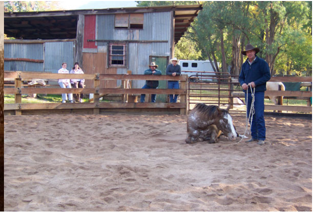
Action in the round yard.

Stockyard Creek is a remote, private and beautiful place